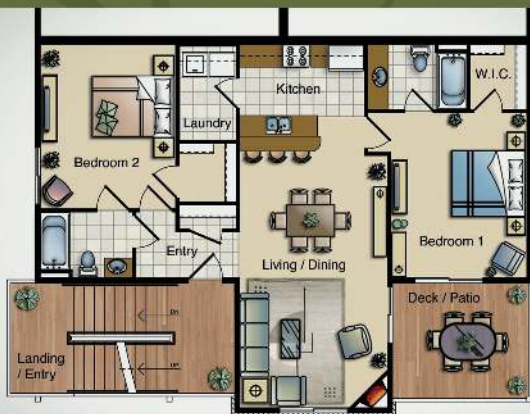
THE BRENNAN 1,107 SQ. FT.