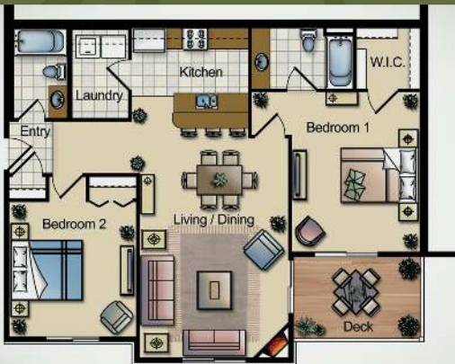
THE SCOTT 1,117 SQ. FT.