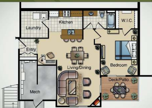
THE EDDIE 959 SQ. FT.

Tour Today: 1301 Village Drive Rapid City, South Dakota 57701